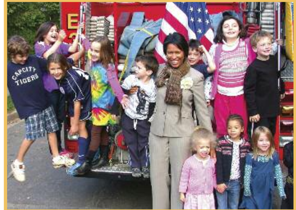
Councilmember Bowser at Quesada Street Fall Block Party with neighborhood kids.

ernments will have to do more with less, work more efficiently and effectively, set programmatic priorities, even as we continue to invest in jobs and people. We must continue to improve corridors, improve neighborhoods, and change lives by ensuring that educational, housing, recreational and employment opportunities are available to all.