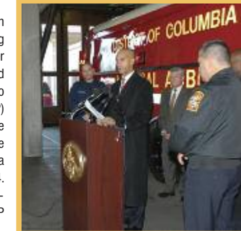
Mayor Fenty at press conference at Engine 24 to release the Fire Emergency and Medical Services (FEMS) 2008 Annual Report.