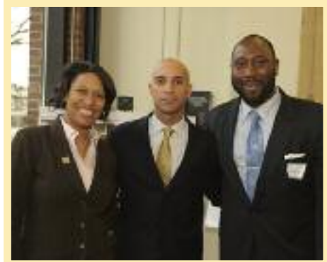
Councilmember Bowser, Mayor Fenty and Commissioner Shanel Anthony at the ribbon-cutting ceremony of the new SED Center—a new child development center in Petworth.