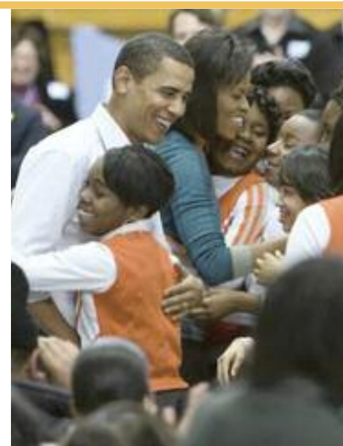
President Barack Obama and Michelle Obama visited Calvin Coolidge Senior High School, where they hosted an event for the National Day of Service.

Muriel Bowser's Office Council of the District of Columbia 1350 Pennsylvania Avenue, Suite 110 Washington DC 20004 202-724-8052-voice, 202-741-0908 fax mbowser@dccouncil.us