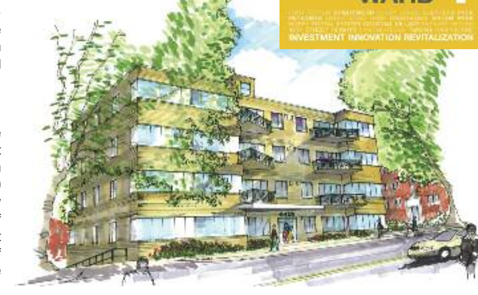
Rendering of 6415 14th Street

This wonderful new 72-unit residential community will open on Georgia Avenue this March 2009. In addition to being affordable to households at 60% of the median income, a new Yes! Organic Market will open on the ground floor this summer.